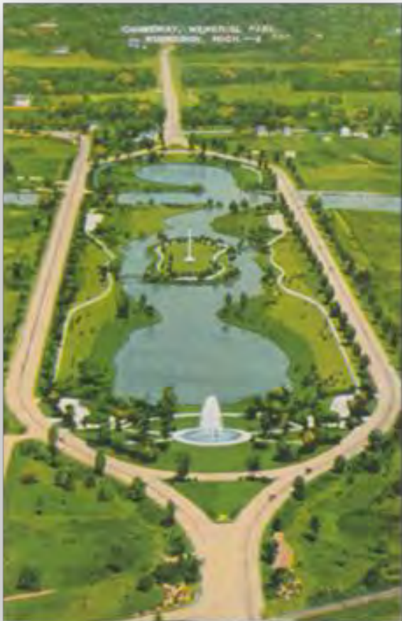
Veterans Memorial Park in 1937

The Muskegon River habitat restoration at Veterans Memorial Park will improve park resiliency and habitat for fish and wildlife by restoring wetlands, creating natural shorelines, and re-establishing fish passage for juvenile, adult and spawning life stages.